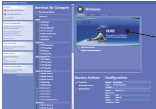
Dreamgallery™ Portal Generator

Take advantage of the easy-to-use Dreamgallery™ Portal Generator to create your own TV portal exactly the way you want it. You completely decide how it will work and what it will look like when presented to your customers.